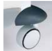
Castor with brake