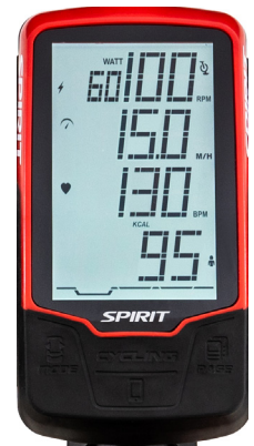
Wireless LCD Console with Bluetooth FTMS

The CIC850 is a high performance indoor cycle that is extremely versatile. Magnetic resistance, commercial grade Hutchinson poly-v belt, 4-way seat and handlebar adjustability, and heavy-duty three-piece crank provide a low-maintenance solution to your high-performance needs. The combination of a large LCD Bluetooth console and adjustable tablet holder allows users to use their phone or tablet to help train with 3rd party apps. Small dumbbells can be stored right under your seat for easy access during workouts and the dual water bottle holders keep hydration within reach.