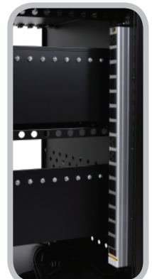
Rear access door of the LLTM30-B open to the power strips.