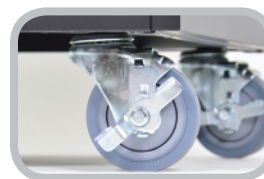
Coated dividers and non skid casters