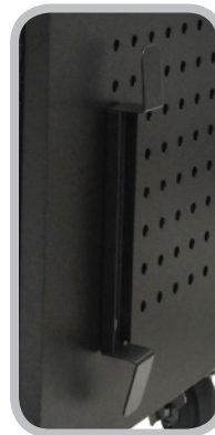
Side cord wrap for convenience.