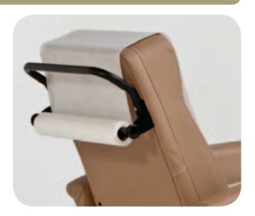
Acts as a shield against the spread of unwanted bacteria. Additional protection to patient as well as the recliner.