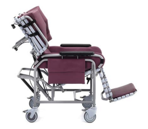
Posterior tilt improves posture, redistributes pressure and aids in fall prevention.