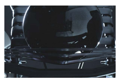
flexes for individualized fit &