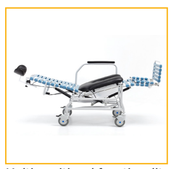
Multi-positional functionality with tool-free adjustability for ease of use