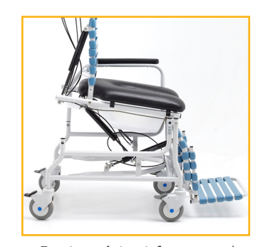
Rust-resistant frame and components, with a 10-year warranty