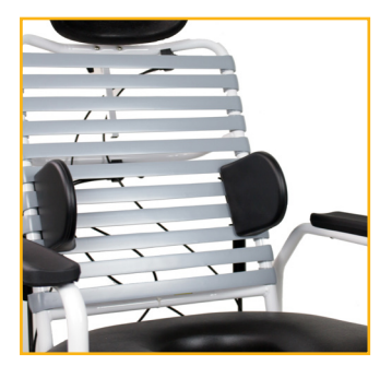
Multiple configurations available to accommodate unique needs