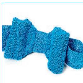
LAB/1/C Head support