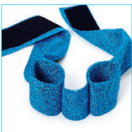
LAB/#/B Abduction Belt