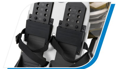
ADJUSTABLE FOOT PEDALS

The SPIRIT Fitness CRW900 Rower brings the timeless tradition of rowing into the gym. The highlight of this machine is its distinctive water tank which provides up to 10 challenging levels of resistance with a simple turn of a knob. The console features a large 5.5" easy-to-read display with 5 pre-programmed workouts to keep athletes engaged. The wooden and steel frame features smooth slide rails, an ergonomically molded seat, and commercial-grade padded handlebar that deliver the ultimate combination of quiet, smooth, and reliable performance.