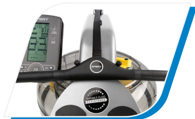
COMFORTABLE HANDLE DESIGN