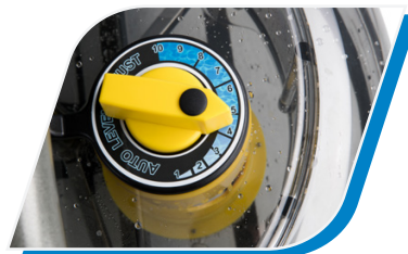
10 LEVELS OF RESISTANCE