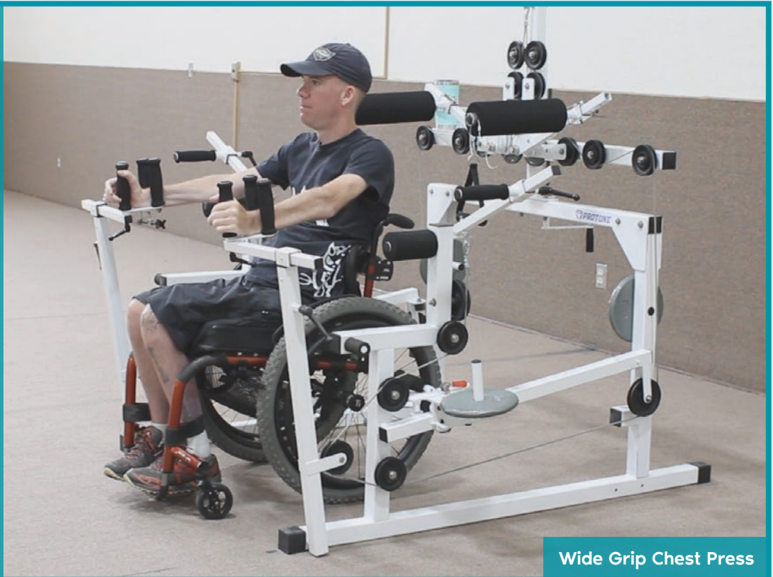
Wide Grip Chest Press