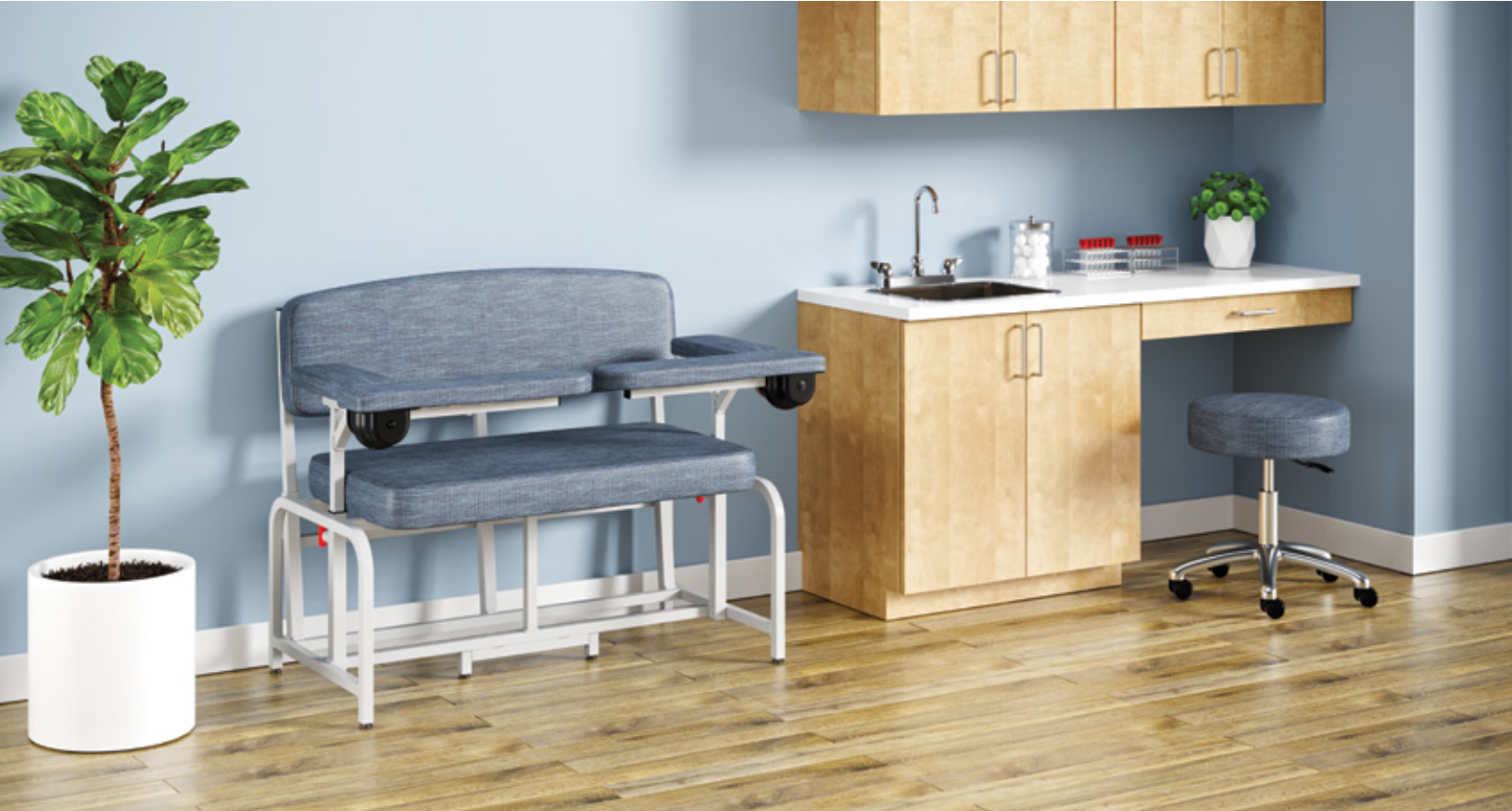
Dual L-Arm Option Shown

Winco's Extra Wide Blood Drawing Chair combines functional design with quality and unmatched durability. The new Harmony BDC offers comfort and convenience with a variety of accessories to accommodate any medical setting where samples are drawn.