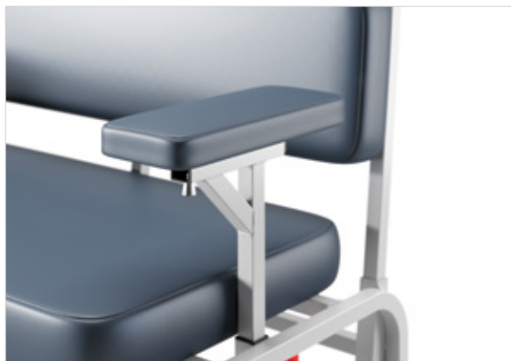
Standard Short Arm

6 high-impact adjustable leveling feet: stable on practically any surface