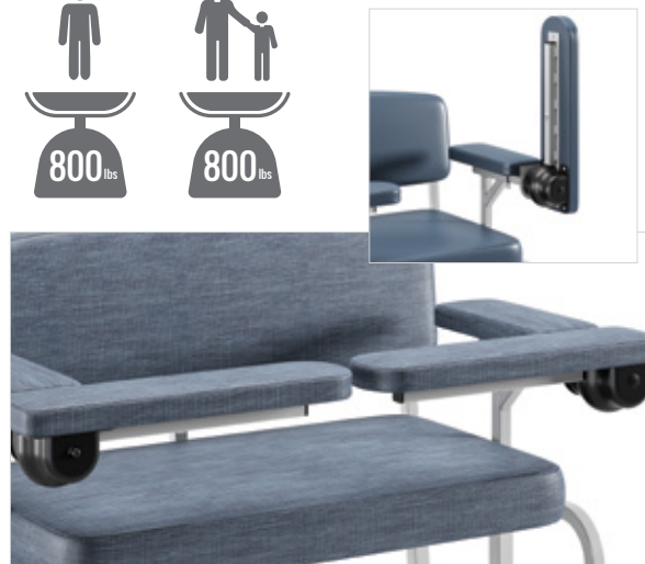
Pinch Resistant Flip-Up L-Arms