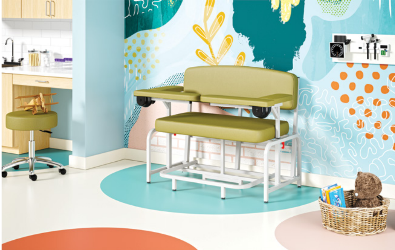
Dual L-Arm and Footrest Options Shown

In Family Practice or Pediatric Care, the Harmony BDC doubles as a one-size-fits-all patients chair or to safely and comfortably seat both parent and child, helping to soothe patient anxiety. The Harmony BDC represents one of the widest and highest weight capacity blood-draw chairs in the industry, tested and verified to BIFMA* standards.