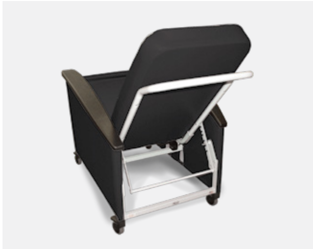
Shown: Patient-Positioning Lock-Bar (Model 5400)

Model 5400 includes a built-in Patient Positioning Lock-Bar which is accessible only by the caregiver.