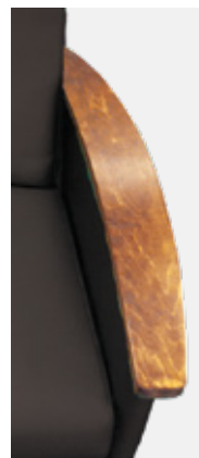
Dark Wood Tone in Wide Width