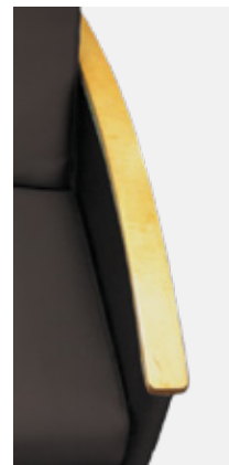
Light Wood Tone in Narrow Width