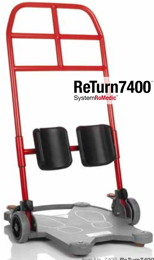
Item No. 7400, ReTurn7400

ReTurn7400 has a low rising ladder that is ideal for shorter adults and children. It also works well in special care situations, such as in an x-ray unit. ReTurn7400 is intended for users weighing max. 150 kg/330 lbs.