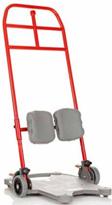
ReTurn7500 suits most adult users.

ReTurn7500 is thus the original and a success story that is sure to become a classic. To enable solutions for more situations while at the same time meeting the needs of more types of users, we have developed several more models of ReTurn. We have also made further refinements to ReTurn7500. However, the basic principle behind ReTurn remains the same: the user's own strength and ability must be utilized and improved. All models of ReTurn therefore have a couple of important features in common: they help to activate the user and they encourage the user's natural patterns of movement. They also give users the opportunity to regularly raise themselves to a standing position. Quality of life can be something as simple as the possibility to use one's own strength and functional ability.