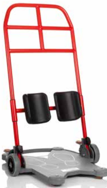
ReTurn7400 is ideal for shorter adults and children.