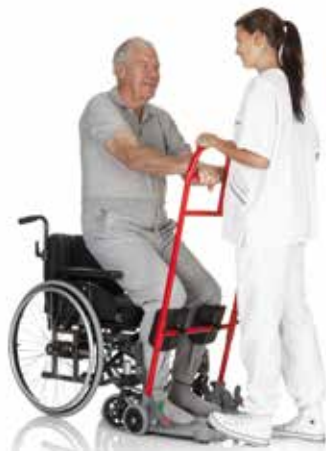
Throughout the entire sit-to-stand procedure, the caregiver must have one foot on the base plate to provide counterweight.