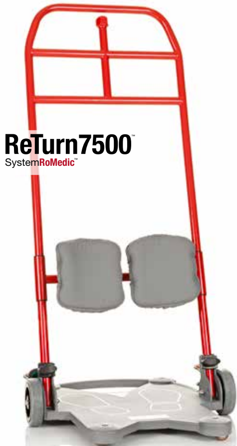
Item No. 7500i, ReTurn7500 , extra padding for lower-leg supports are included as standard