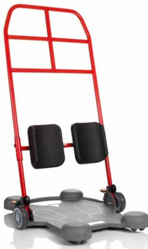
ReTurn7600 has been developed for larger and heavier users weighing up to 205 kg/450 lbs.