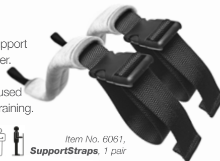
Item No. 6061, SupportStraps, 1 pair

SupportStraps are an accessory which, together with ReTurnBelt, function as lateral support for ReTurn7500/7400/7600. One SupportStrap is affixed to each side of the rising ladder. When the user is in a standing position, the other end of the SupportStrap is attached to the appropriate handle on either side of the ReTurnBelt. SupportStraps can also be used as leg harness for EasyBelt and FlexiBelt in connection with standing training and gait training.