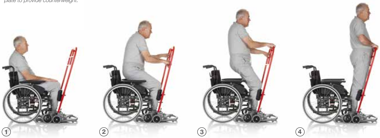
1 The user lifts the feet somewhat and places them on the base plate markings. The base plate is then rolled in under the bed, chair or wheelchair, so that the lower legs are supported by the lower-leg supports. When ReTurn is in the right position, the caregiver locks the wheels.