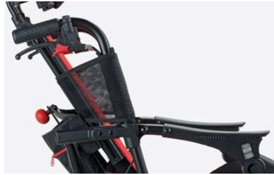
844 Padded side protection covers