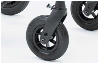
812 Front wheel directional locks