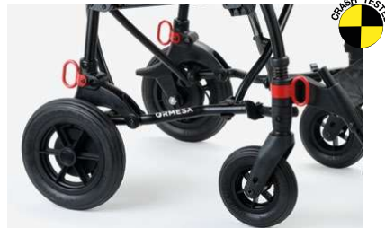
891 Set of 4 tie down hooks for the forward-facing transport of the pushchair in a motor vehicle (private/cars, buses..). See User and Maintenance Manual provided with the aid.

It increases the total height of max. 7 cm/2,7 in (94-101 cm/37-39,7 in)