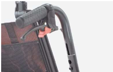
951 Height adjustable push handles

It increases the total height of max. 7 cm/2,7 in (94-101 cm/37-39,7 in)