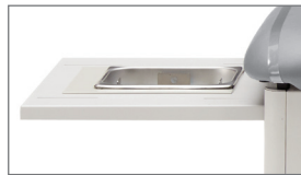
Stainless Steel Debris Pan