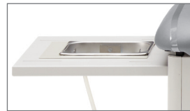
Urology Drain Pan