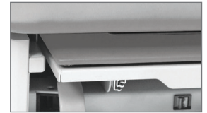
Receptacle & Heater