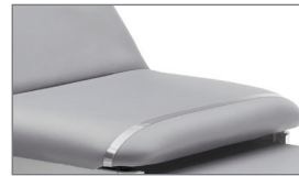
Paper Fastener Strap