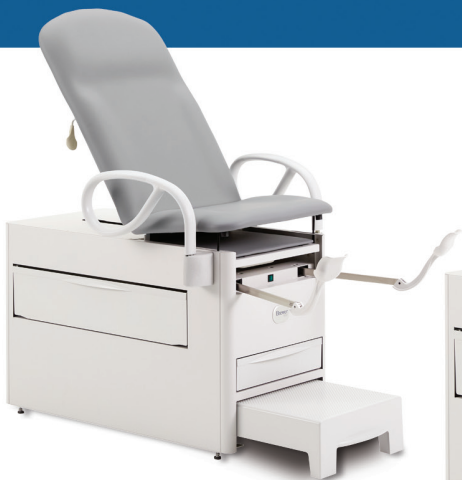
Standard top with patient assist handles, stirrups and pelvic tilt

An exam table as diverse as your patient population.