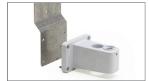
Welch Allyn Bracket