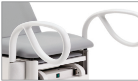
Patient Assist Handles