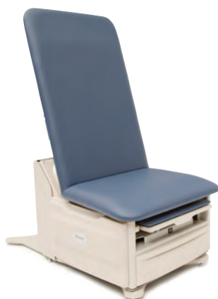
FLEX ™ Access Exam Table