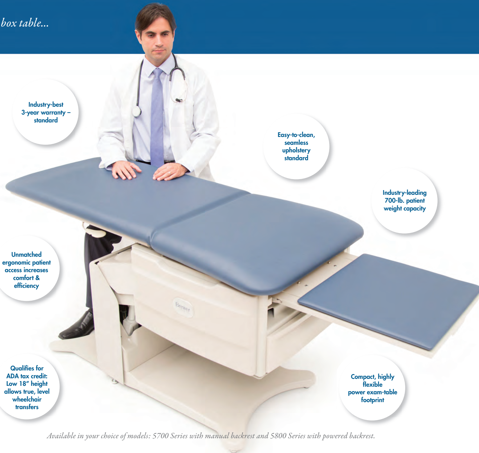
Available in your choice of models: 5700 Series with manual backrest and 5800 Series with powered backrest.