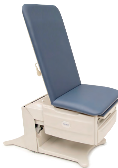
5700 Series with manual backrest shown; 5800 Series with powered backrest available.

* Visit http://brewercompany.com/wp-content/uploads/Tax-Credit-Flyer.pdf for more detailed information regarding qualifying tax credits.