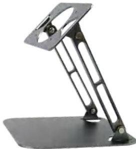
Aluminum Table Top Stand