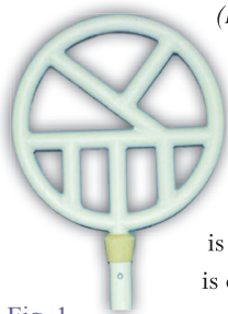
Fig. 1 Halo Safety Ring

One such device is the Halo Safety Ring (Figure 1) which takes into account the varying tolerances of mattresses, including both shifting and mattress compression.