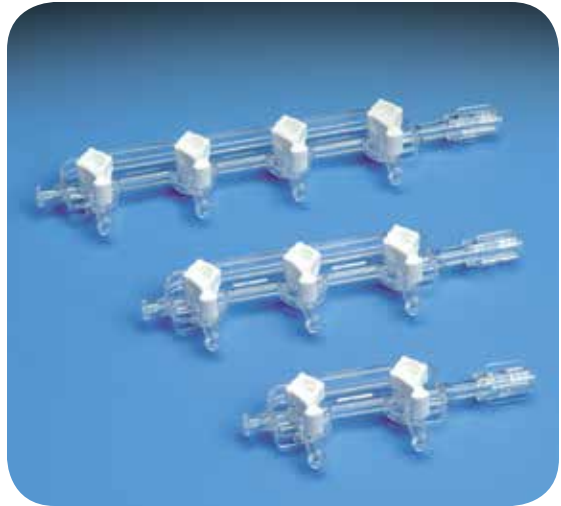
* Patent # 5,527,299.