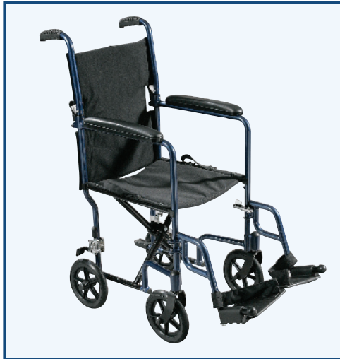
REF. ATC-BL Shown

It is important for the attendant to be familiar with proper assisting procedures in any situation that requires the use of the Transport Chair. Safety is the Key consideration. Consult your physician, nurse or physical therapist to determine methods most suitable for your individual needs and abilities.