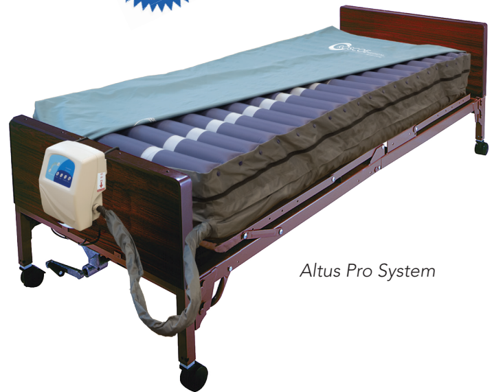
Altus Pro System