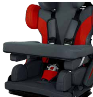
TABLE promotes the uprightness and posture of the child and gives them additional safety (can only be used with armrests).

ARMRESTS provides good support for the forearms