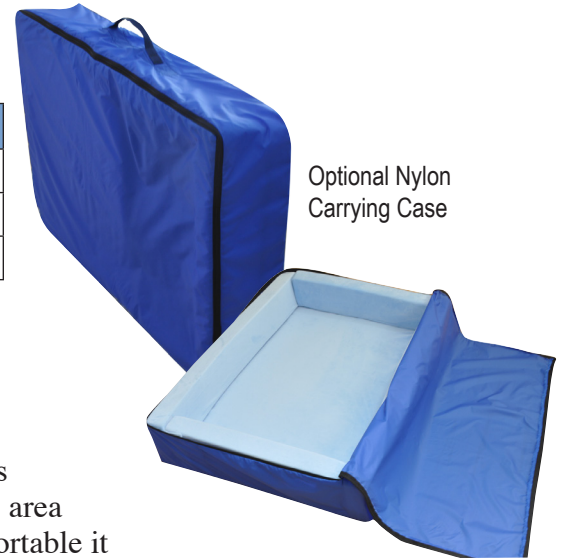
Optional Nylon Carrying Case

Warning: Use on floor only. DO NOT leave unsupervised orientation of wedge.