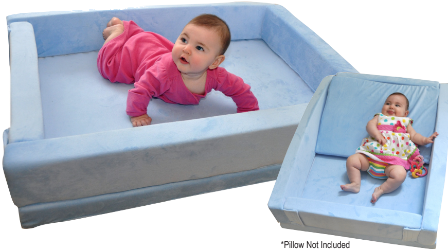
*Pillow Not Included