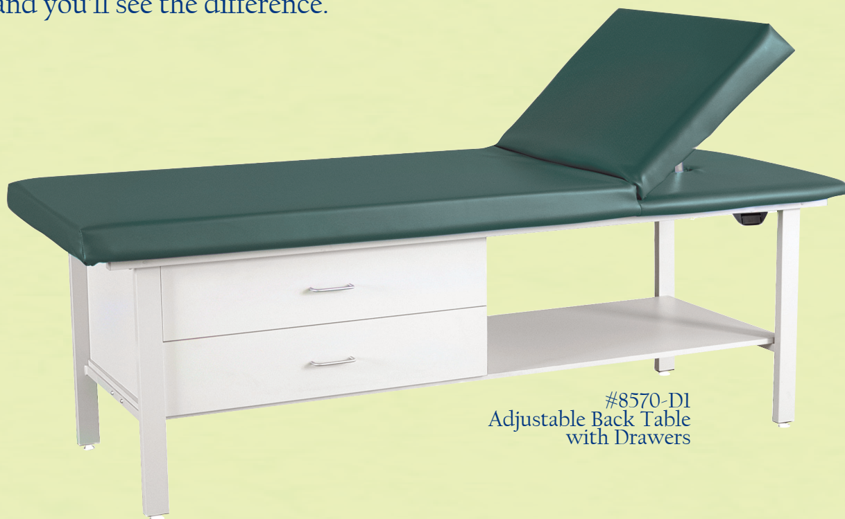
#8570-D1 Adjustable Back Table with Drawers

Our adjustable back tables offer the durability and range of standard features you expect at a price that you'll love. One look, and you'll see the difference.