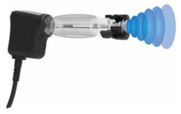
Ballistic Mechanism of Radial Pressure Pulse Therapy