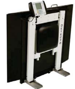
Correct Storage Position