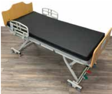
UNITY 600, UNITY 750

The UNITY BED has a low height of 6.75" and a high height of 30" to meet all your caregiving and client needs. With a 12-button hand pendant and optional footboard attendant controls, customized comfort is an easy adjustment.