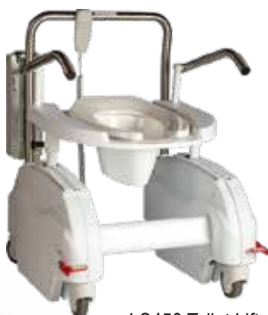
LS450 Toilet Lift