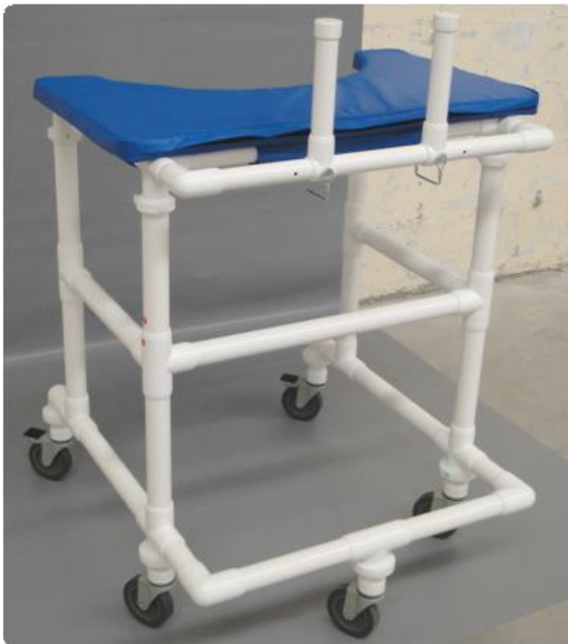
450-ADULT PLATFORM WALKER COMPLETELY ASSEMBLED.