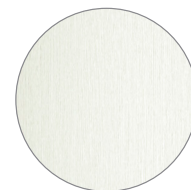
White Wood Grain