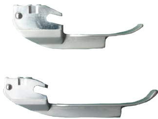
Miller O & 1 Blades