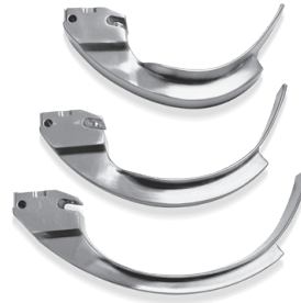
Optional Curved Mac "D" Blades Sizes 1,2,3,4,5