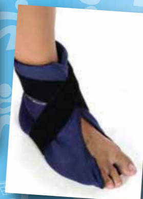
FA6080 - Foot/Ankle Wrap