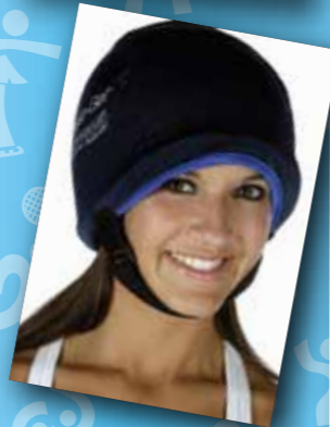
CAP610 - Helmet