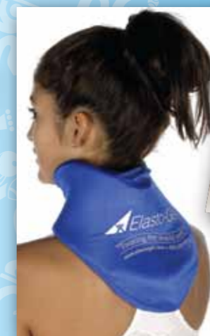
CC102 - Cervical Collar

Provides therapy for minor muscular and soft tissue cervical injuries.