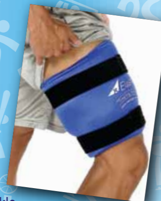
TW6010 - 9"x24" Therapy Wrap