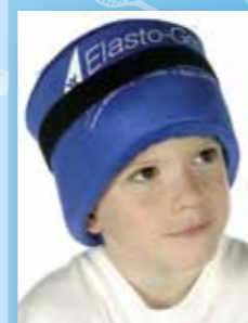
TW6001 - 4"x24" Therapy Wrap