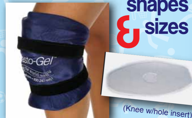
(Knee w/whole insert)