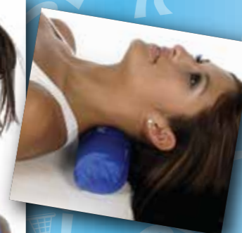
Support Rolls CP4001 - Sm 3"x10" CP4005 - Lg 4"x10"