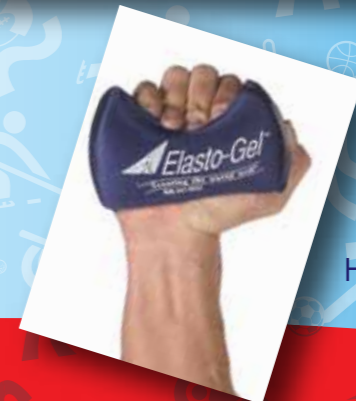
HE5001 - Small 1 1/2" x 5" HE5005 - Large 3" x 5" Hand Exercisers