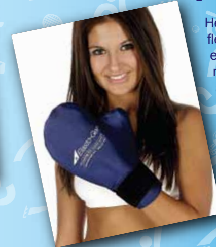
TM7001 Therapy Mitten

Heat helps to restore flexibility and provides excellent therapy for minor injuries during, and after rehabilitation exercises.