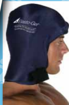
CAP600 - Sm/Med (hat size 8 or smaller) CAP602 - Lg/XLg (hat size 9 or larger) - Cranial Caps