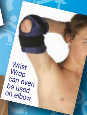
Wrist Wrap can even be used on elbow