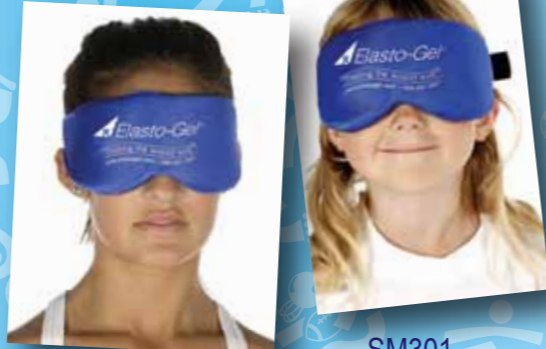
SM301 Sinus Mask

Relief for minor soft tissue injuries of the head, face, and jaw. Use cold to reduce swelling, hot to stimulate blood flow.