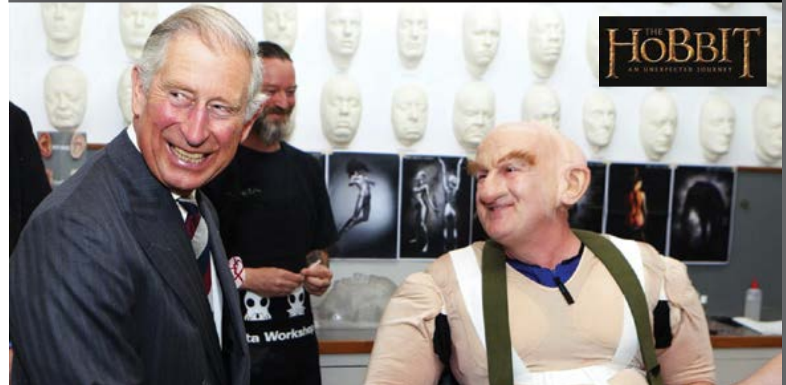
Prince Charles visits with an actor wearing our KewlFlow™ Circulatory Cooling Vest from The Hobbit: An Unexpected Journey movie.