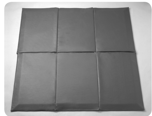
Connect two Floor Cushions to create a wider area of coverage

NOTE: Due to the random possibility of falls, the Posey Company makes no guarantee, express or implied, that the user is protected from hip trauma.